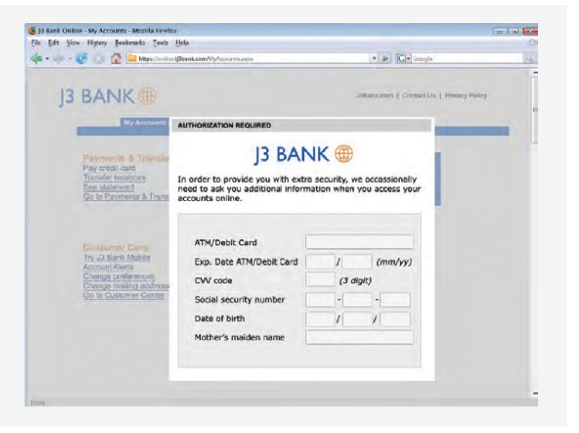
Figure 2: Falsified Web site used to fool users into revealing credentials and personally identifiable information